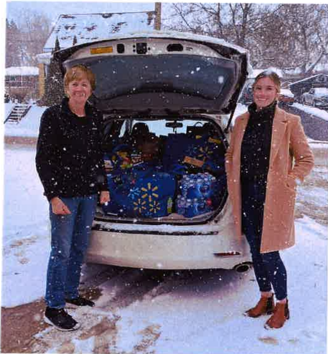
NWMO 2022 Food Drive with the Walkerton Food Bank.

A significant part of the work being done in South Bruce and the surrounding area is building relationships and providing valuable information about the project. You'll see our engagement team at hockey tournaments, fall fairs and many other community events.