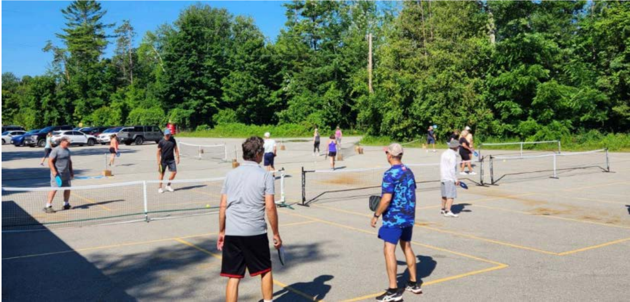
Point Clark Pickleball Courts