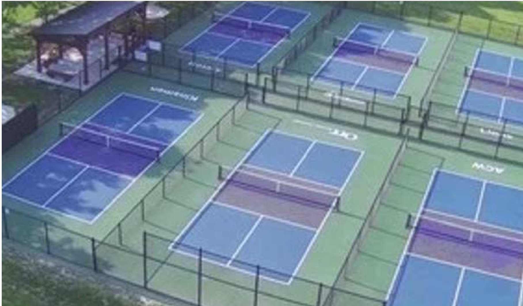
Goderich Pickleball Courts