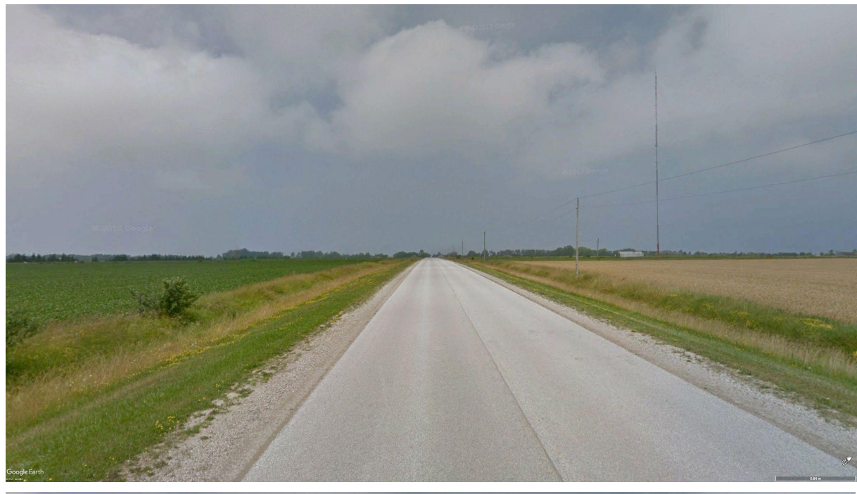
View 1 - From Bruce Rd 6