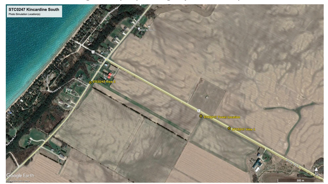
Figure 2: Key Map Showing Subject Site & Viewpoint

The proposed location comprises approximately 34.676 acres of land zoned for Agricultural Zone uses allowing for a considerable setback from the majority of residents.