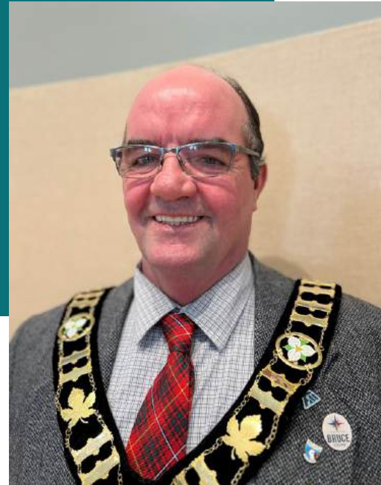
Don Murray Mayor